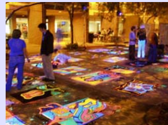
(Left) Students performing under the big top at the circus; (Above) Students taking in the popular "Art in Low Places" program in the Union Courtyard