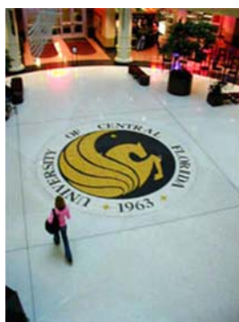
(Right) Tours were given of the UCF student union during registration and check in!