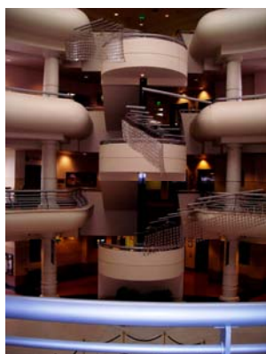
(Left) With over 29,000 square feet of meeting space, the Student Union serves the University as a comfortable gathering place for students, faculty, staff, alumni, parents and guest.

Sunday morning brought our journey sadly to an end. The awards ceremony was tear filled and jammed packed!